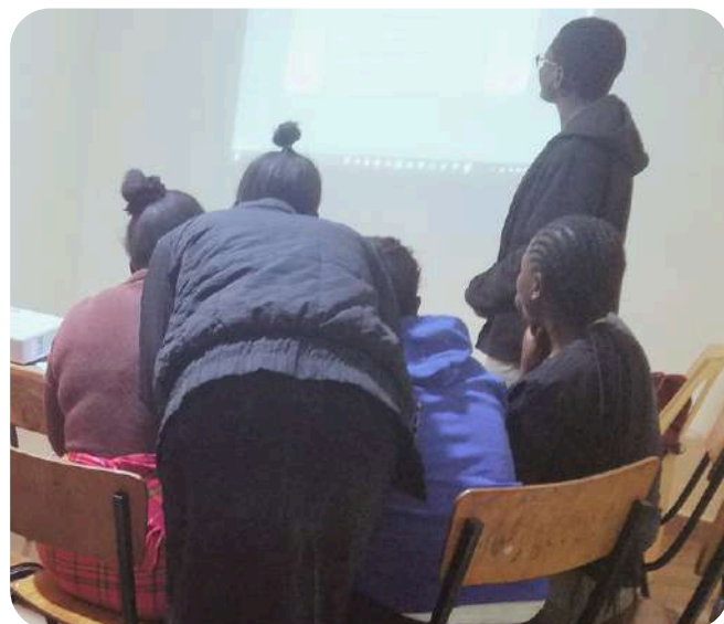
Digital literacy class