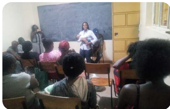
Mentorship and counseling